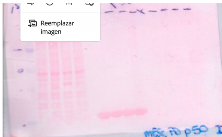
Figure 5. Source data 1. Original membranes corresponding to Figure 5, panel C.